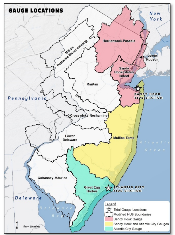
Figure 1 Map of Divide Between Gauges Used for Mapping

Using the storm event factors described above, as well as terrain data, soil information, and land use data, floodplains were developed using a two-dimensional (2-D) rain on grid model with HEC-RAS.